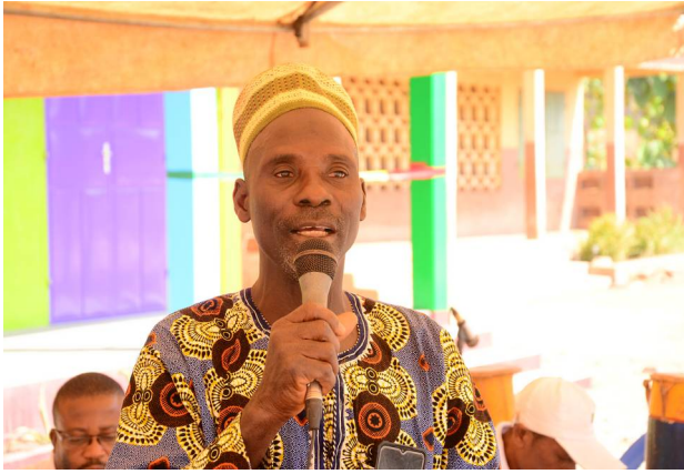
by the chairman of the PTA