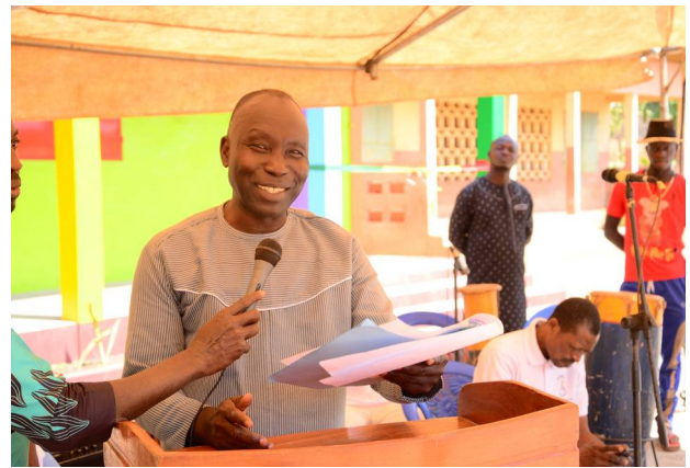
the chairman of our NPO,