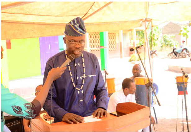
by the chief of the village