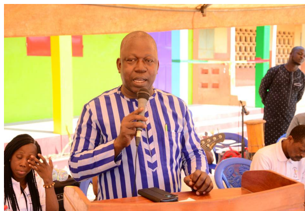
by the mayor.