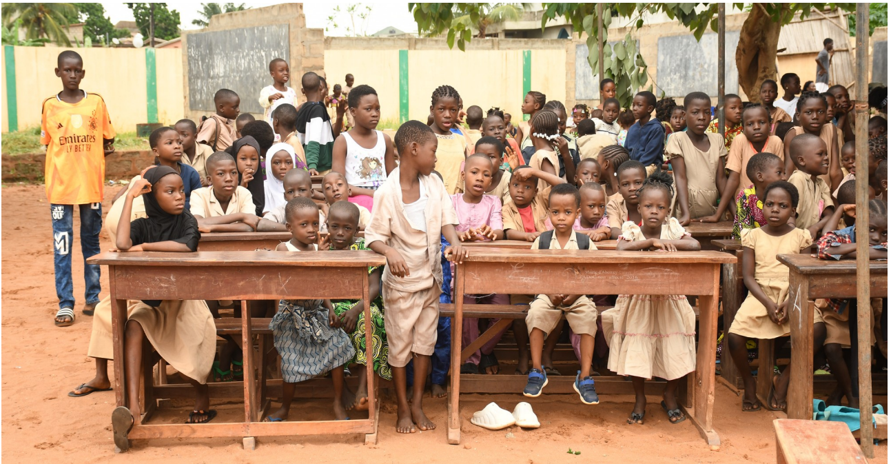
The children are ready !