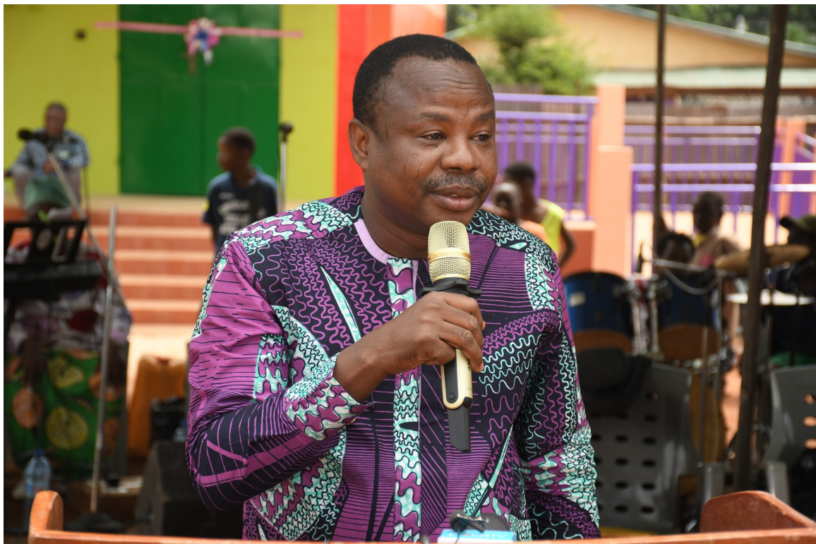
The Director of Preschool and Primary Education of the Department of Atlantique (Federal State) praises the work and commitment of the two associations "Bildungswerk Westafrika e.V." and "Actions de