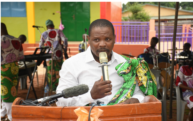
The moderator explains the program and announces the students for a dance performance.