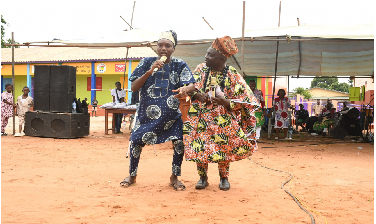
Our chairman and his son sing together our song “Consommons local” (let’s buy locally).