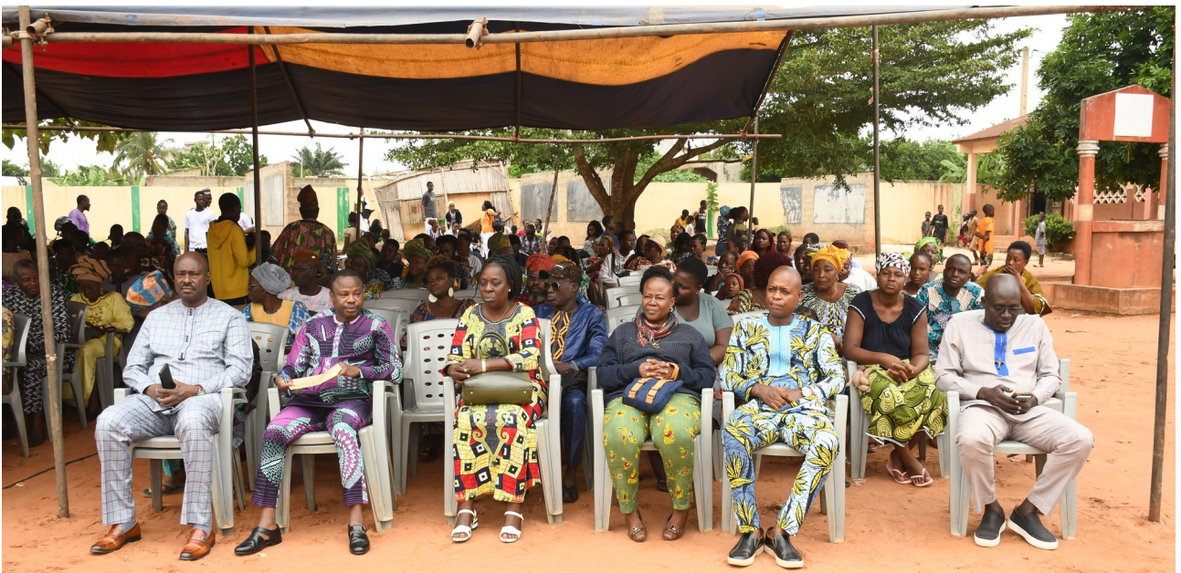
The parents too !