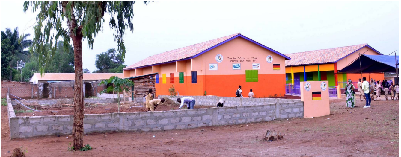
The new buildings with the school garden