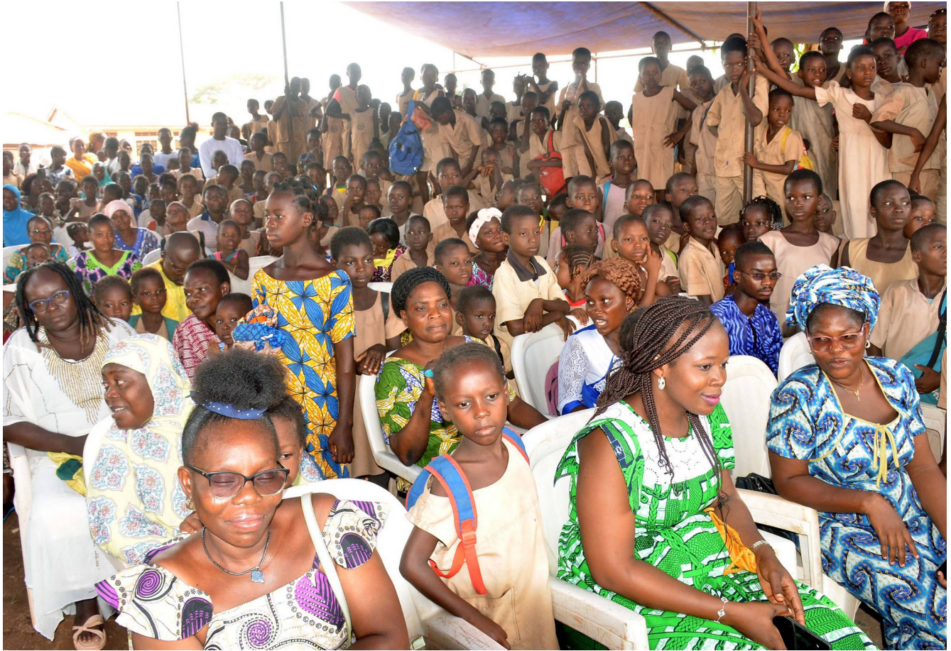
Many people came to attend the opening ceremony. The school children welcomed us with a dance.