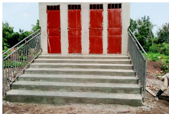
for the primary school.