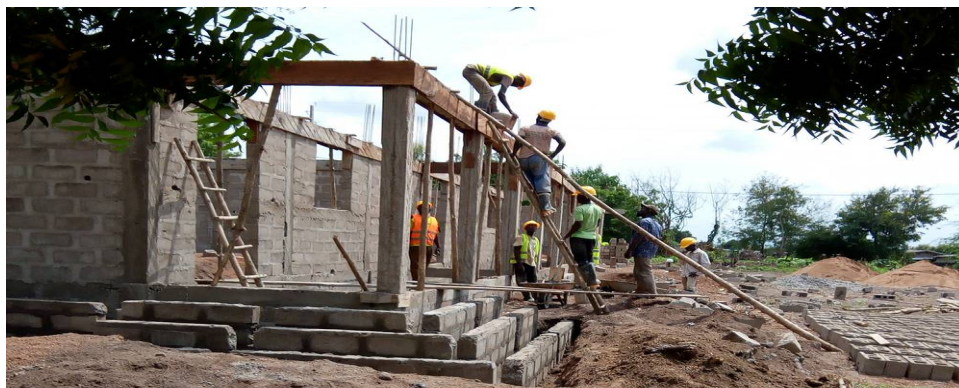
The iron anchor above the lintel was cast in one piece.