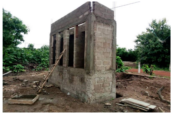
The toilet pots were delivered.