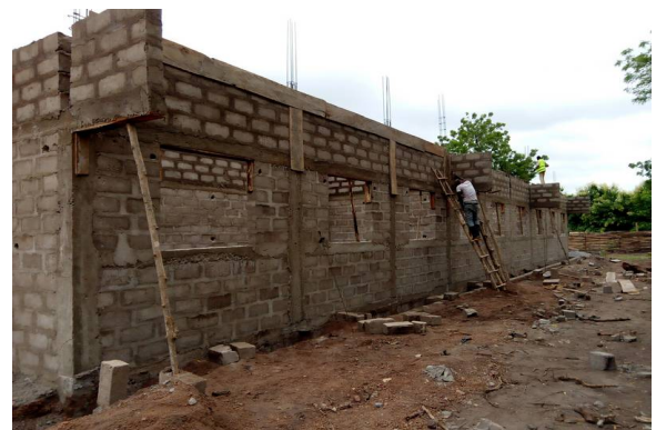
The iron anchor below the roof was boarded.