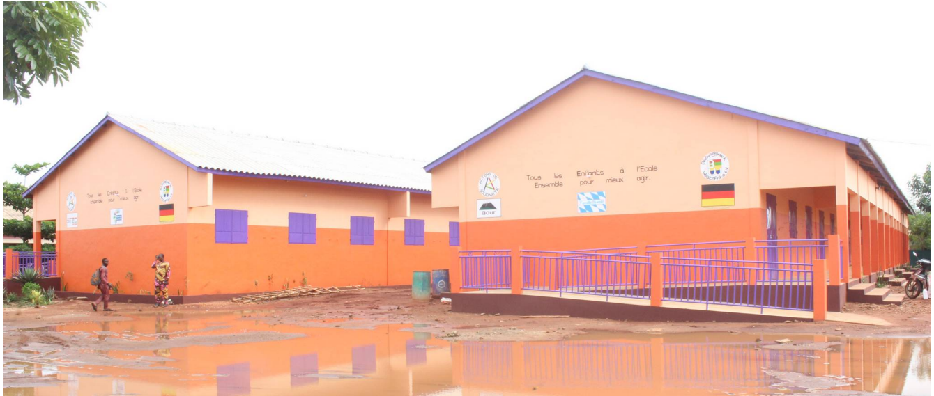
The new buildings