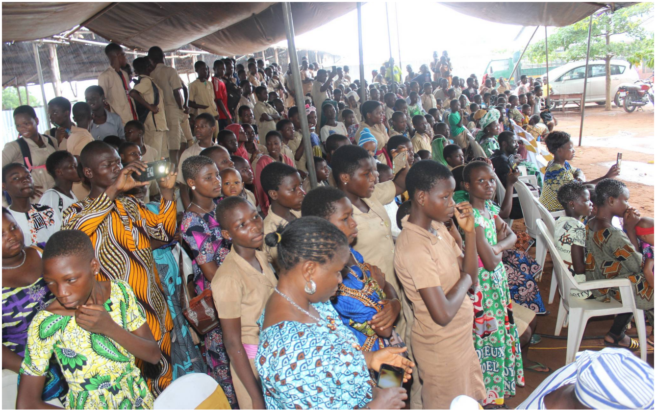
Despite the rain, many people came to the opening ceremony. The students welcomed us with a dance.