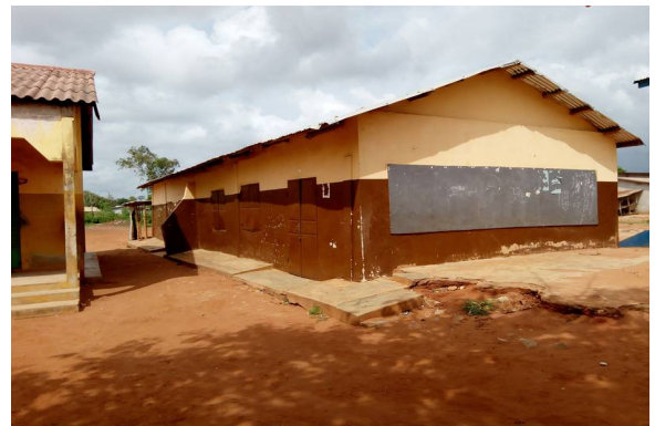
The renovated building with 2 classrooms