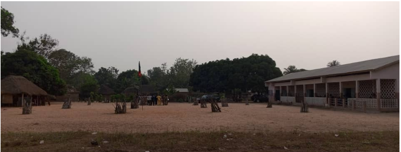
Overview of the school