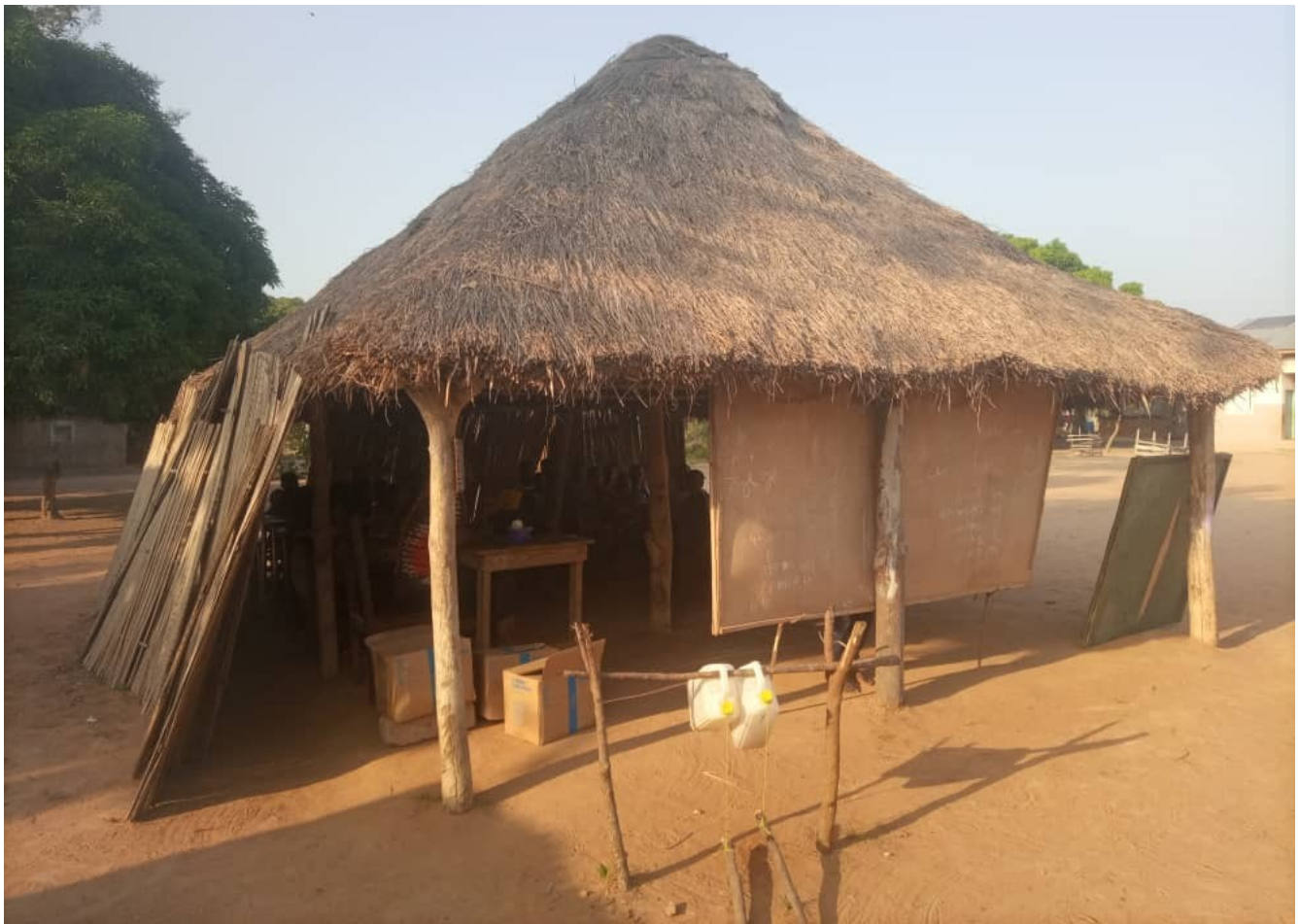
Two school classes are accommodated in these shelters. A homemade handwashing station is located in front of the shelter.