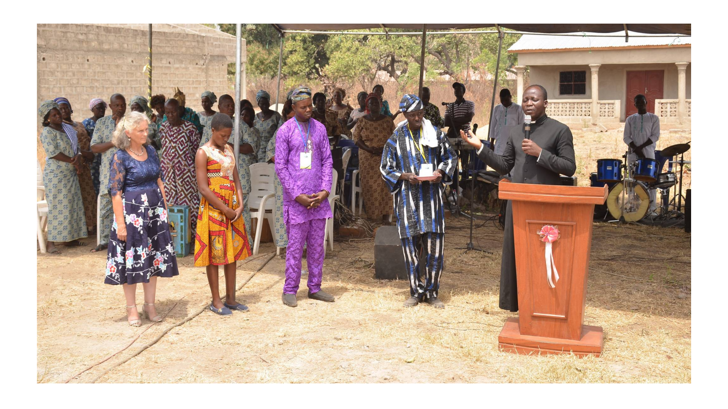
Blessing from the Catholic priest who was very committed to the project.