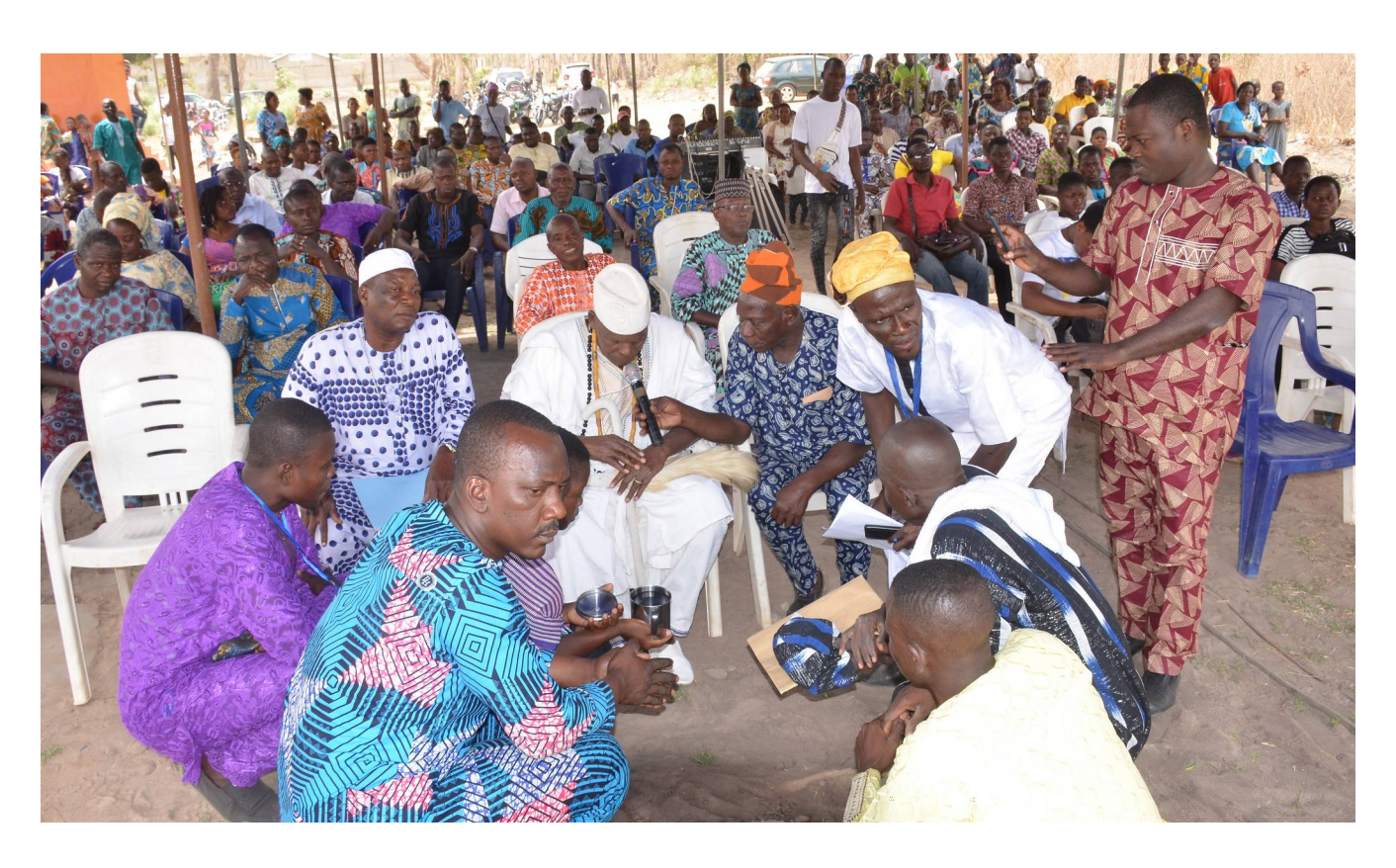
Blessing by the king