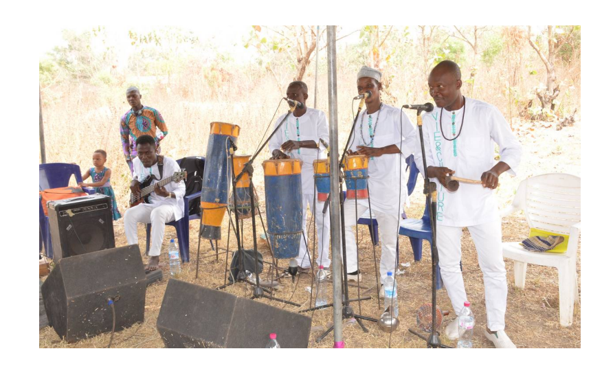
Vie et Culture