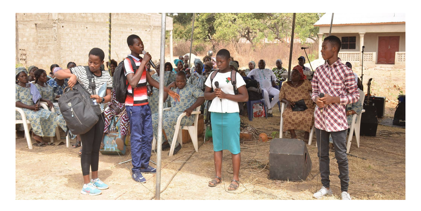
A play by students who learn German at the center.