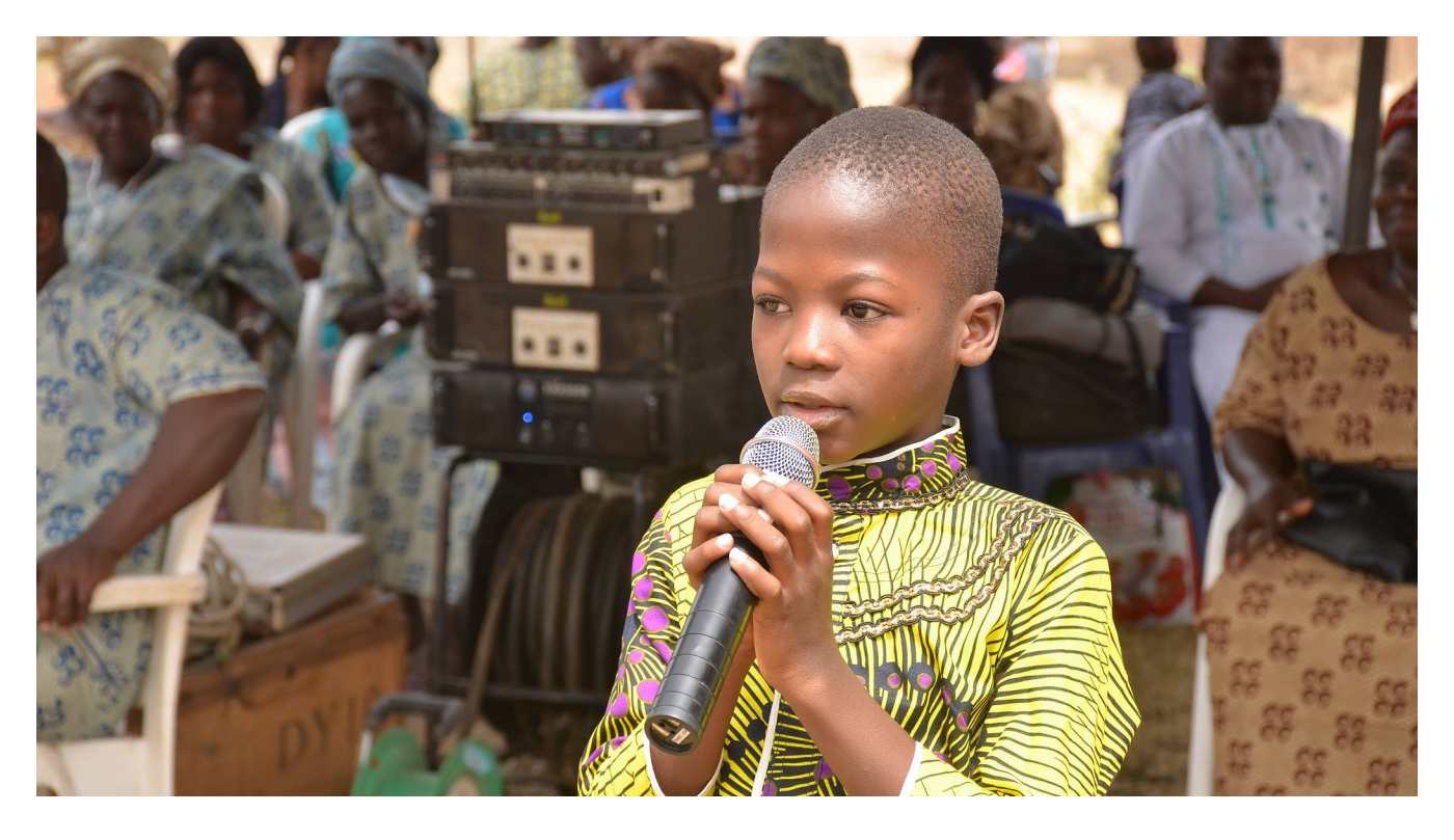
Speech in German language by a boy who is learning German in the study hall.